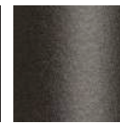
WARM GRAPHITE 180