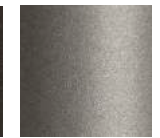
SILVER GREY 170