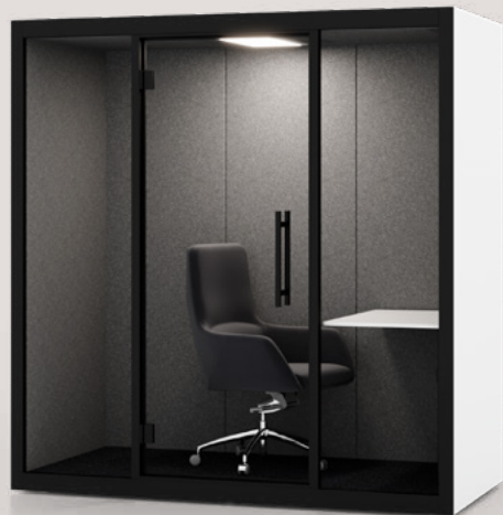
Table Height adjustable table with white antibacterial laminate Power outlets Additional 110-240 V power outlet on the wall Screen bracket universal bracket with cable management (optional)

Workstation Turn privacy into productivity with Duo Workstation